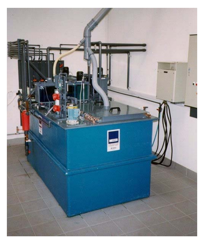
MECER Recovery Unit Integrated in the Production of Printed Circuit Boards

In the manufacturing of printed circuit boards (PCB) in the electronics industry, copper is commonly etched with an ammoniacal solution (etchant), containing free ammonia, ammonium chloride and some oxidants. Optimal etching efficiency is obtained when the copper concentration in the etchant is 140 - 160 g/l.